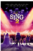
JULY 30 - SING 2

Bring the whole family to enjoy a weekend movie screening at the library.