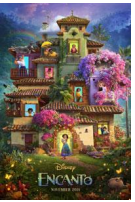
AUGUST 20 - ENCANTO